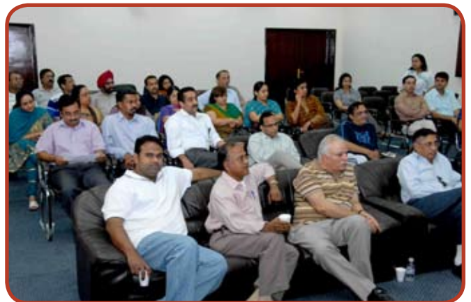
1st executive meeting 2010