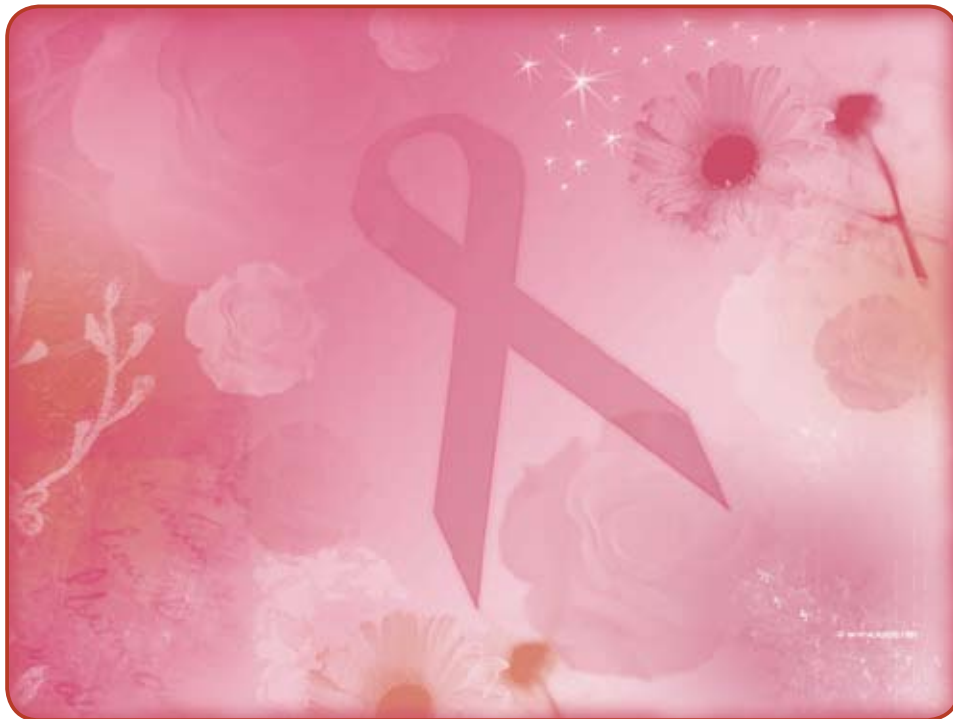
Early Discovery Aids Recovery

The campaign came to an end on 29th October at KMA Hall with the final seminar.