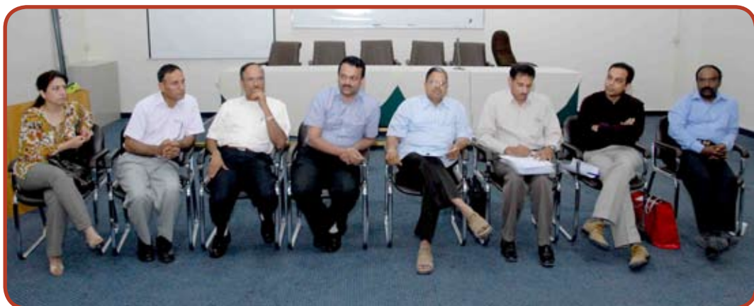
1st executive meeting 2010